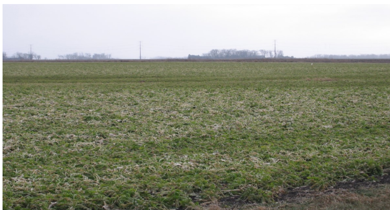
2016 Cover Crop - High Island Creek and Rush River TMDL Project

Ron Otto—Watershed Technician: 507-234- 5435 ext. 105